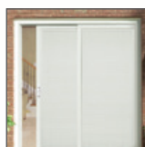
Controls light and privacy