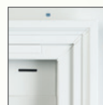
Brick Mould J-Channel