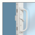
Dual Point Lock (Standard)