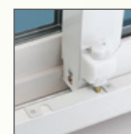
Foot Bolt Lock