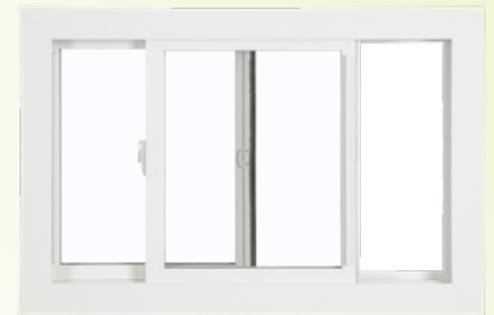
2-lite sliding window