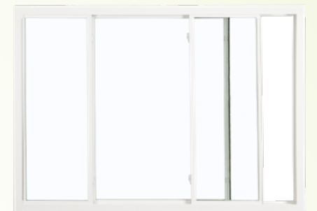
3-lite sliding window