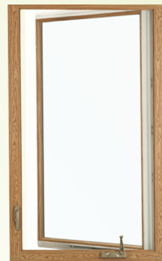
Single vent casement