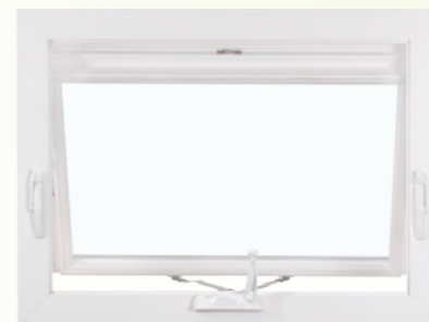
Single vent awning